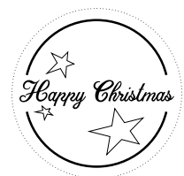
punch round 1"